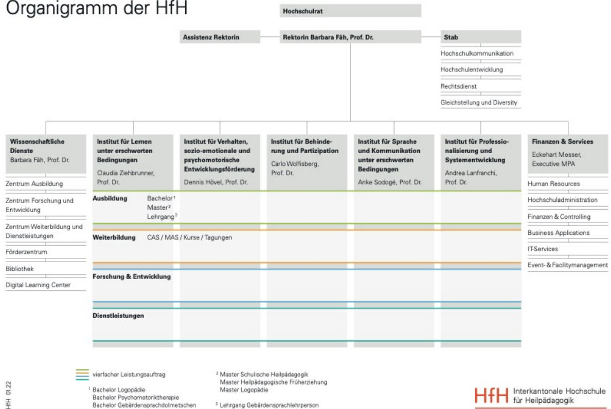
Figure 1. Organization chart of the HfH (in German)