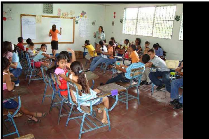
A lesson on Peace Building Skills in a Nicaraguan school.

Working on the basements of citizenship also will permit to build new connections to other development and cooperation projects on this topic. Moreover we want to research in which way it is globally possible to implement good teaching strategies that allow to develop social emotional competencies and peace attitudes in teachers and their pupils. We consider that such knowledge is of great interest for any other institution in the world whose aim is to foster positive values and social competencies in children and youth.