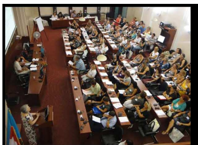
A workshop with teachers on Social and Emotional Learning skills.

the change we want to promote in our societies, in order to achieve a better life standard everywhere in the world. Moreover, since the two institutions play a significant role by fostering and regulating public education in the society, this project is although to see as a contribution to Millennium Development Goal number 2: "Achieve universal primary education".