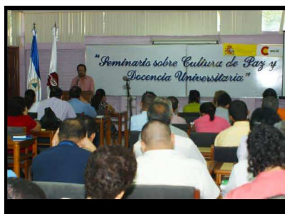
A workshop with teachers on Peace Building Skills.