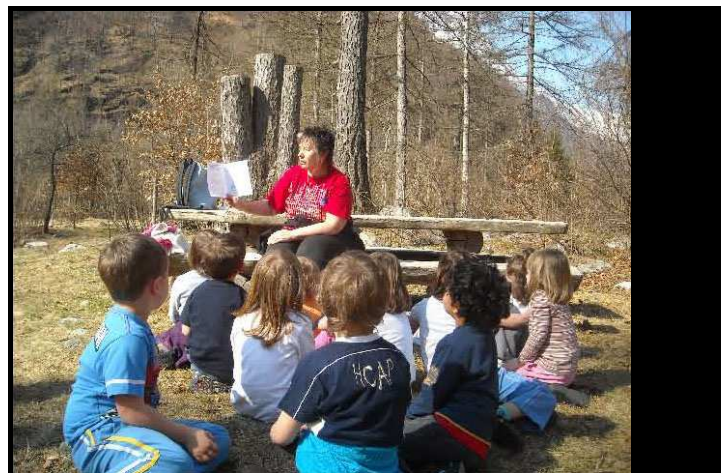
An outdoor lesson on Social and Emotional Learning skills with children in Switzerland.