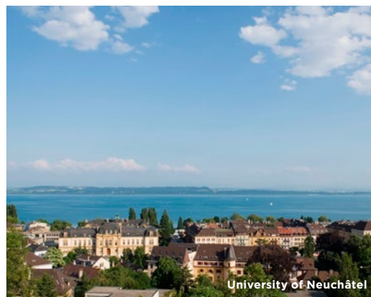
University of Neuchâtel