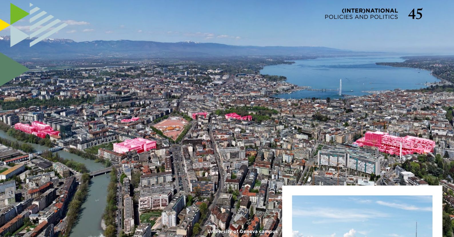
University of Geneva campus