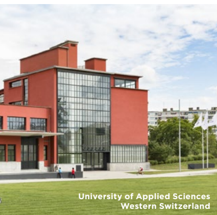
University of Applied Sciences Western Switzerland