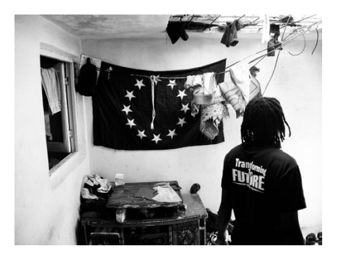
Image 1: Cameroun community – selforganised housing project in Fès